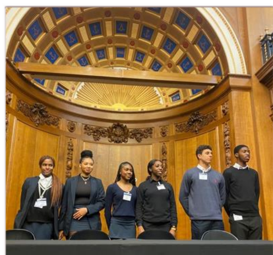
Champions of the Sherriff's Challenge 2024