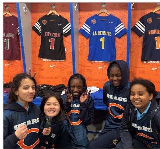
American Football Club #NFL