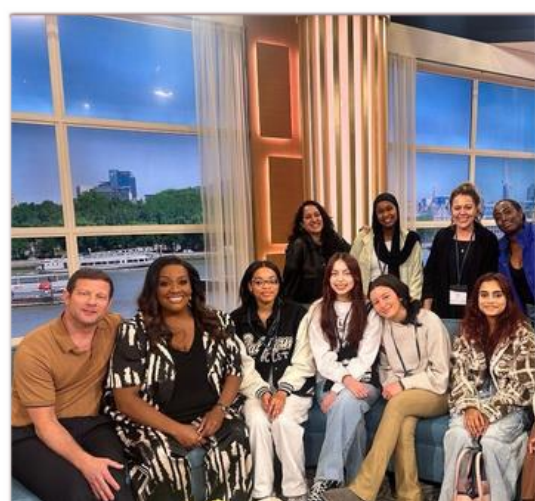
Visit to ITV Studios